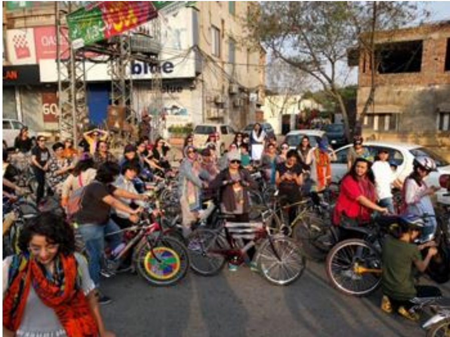
‘Girls at Pakistan